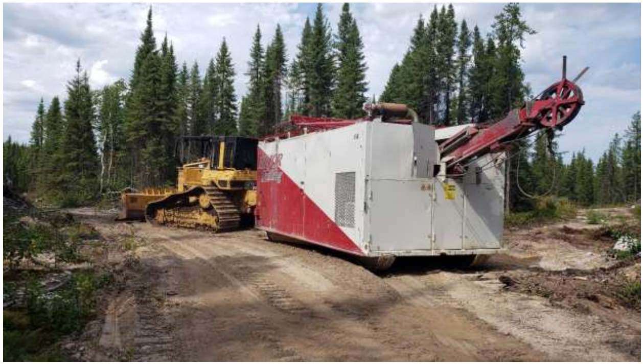
Figure 1 – Major Drilling Mobilizes Drill Rig to Case Lake

Haydn Daxter, Power Metals' CEO commented "The Company is extremely excited to have a drill rig back on the ground at Case Lake as we continue to test and develop our cesium footprint at West Joe and Main Zone. Drilling is expected to continue over the next 6-7 weeks for all exploration holes planned for Phase II, with the first round of assays expected in October".